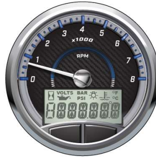
5" TACH S-DIG W/BUTTONS