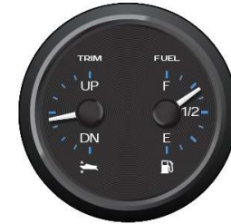
3" 2H1 TRIM/FUEL