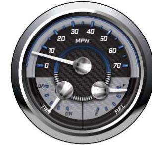
3" 3N1 SPD/TRIM/FUEL