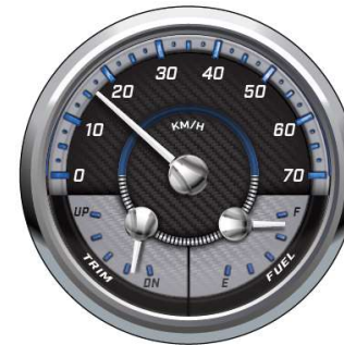
5" 3H1 SPD/TRIM/FUEL