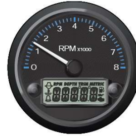
3" TACH S-DIG W/BUTTONS