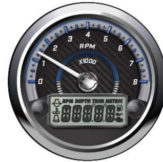
3" TACH S-DIG W/BUTTONS