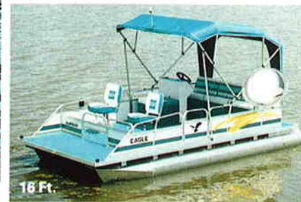
Boats shown with optional furniture.