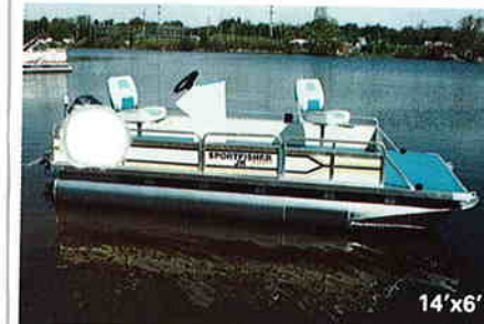
Boats shown with optional furniture & accessories