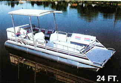
Shown w/Optional Hard Top