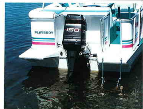
Shown w/optional ladder