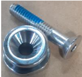
BIMINI QK CONNECT SS DECK BUTTON (X4) PART #100406