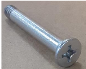
BIMINI MOUNT BOLT W/ LOCTITE (X2) PART #100541