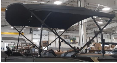
STANDARD SQUARE FRAME