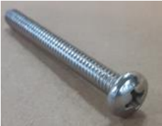
#10-24X 1 3/4" PAN PHILLIPS (X4) PART #050348