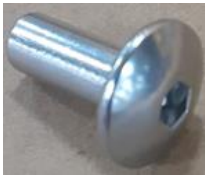
BIMINI QK CONNECT SS DECK BARREL NUT (X4) PART #100408