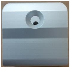
BIMINI MOUNT (X2) PART #100540 OR 100540BLK