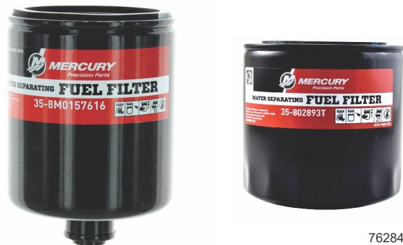
Original and replacement filter shown

This temporary filter is not compatible with the water-in-fuel (WIF) sensor since there is no plug adapter in the bottom of the filter.